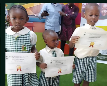
ISIEC's 2 nd Term 2024/2025 Scholarship Award

poised young adults in SS2 preparing for their next chapter, the story is the same: opportunity changes everything. A total of thirty-four pupils/students emerged as top position holders in their classes, each earning a place as a scholarship beneficiary. For many, this was the difference between a parent's worry and a parent's joy.